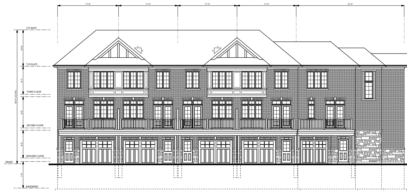
BUILDING 1 - REAR ELEVATION