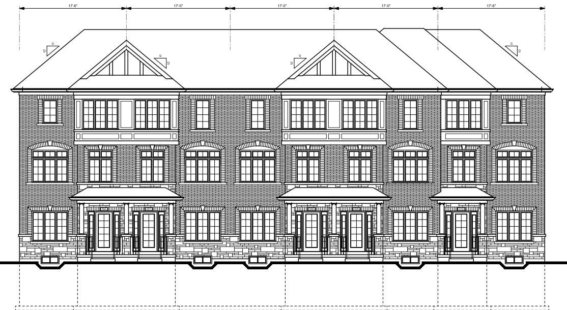
BUILDING 2 - FRONT ELEVATION