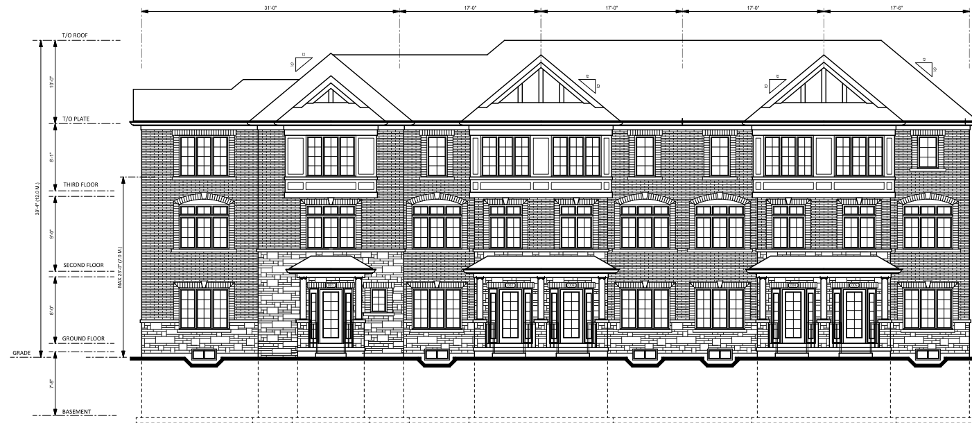
BUILDING 1 - FRONT ELEVATION