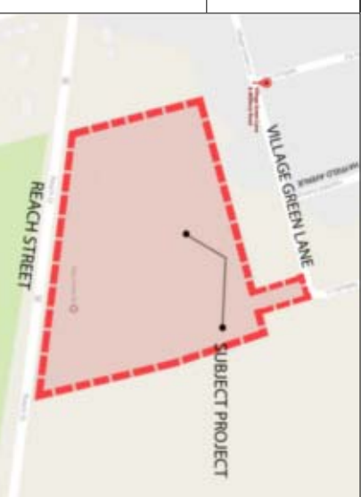
KEY MAP - NOT TO SCALE