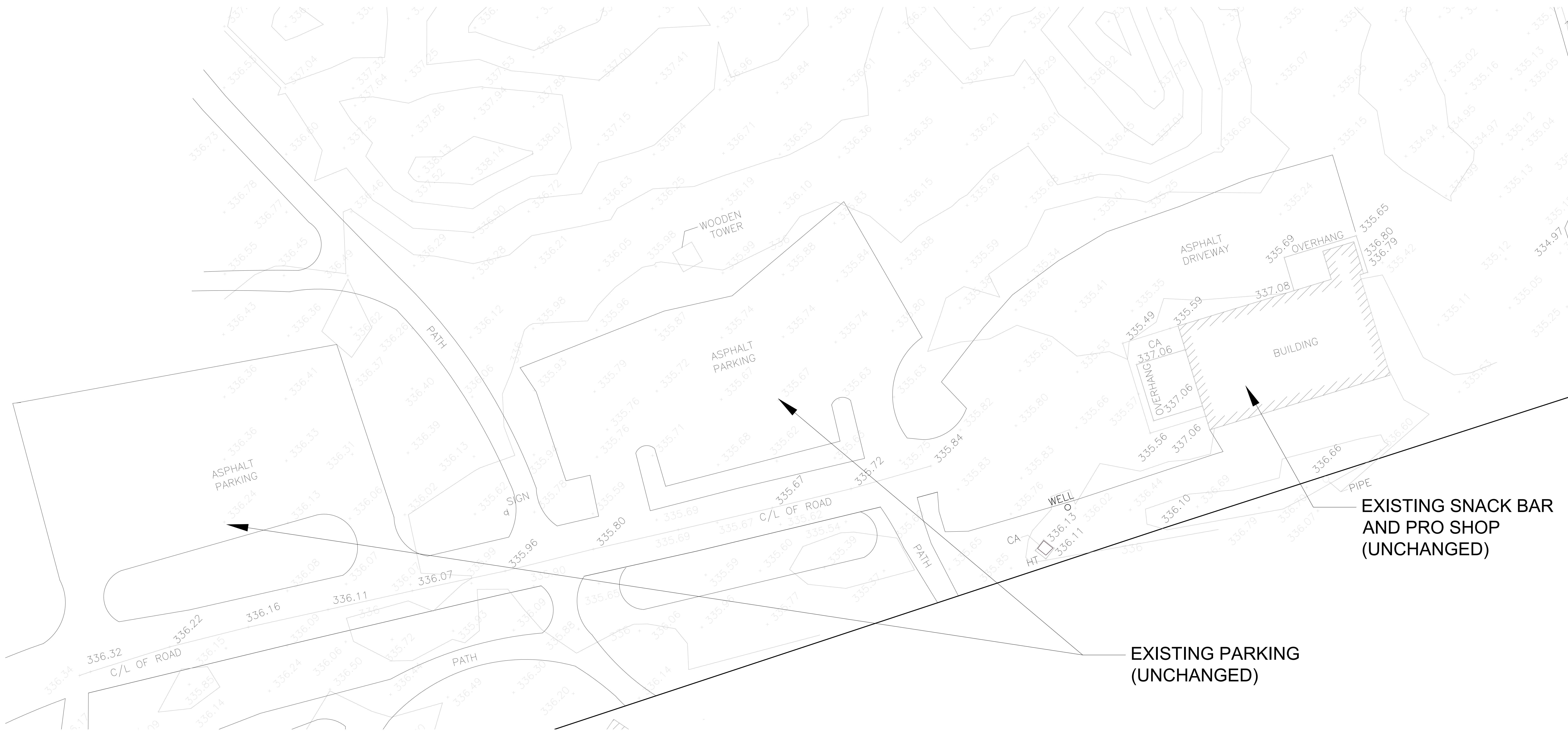
3 EXISTING SITE PLAN A1.1 1:200

The Architect is not responsible for the accuracy of survey, structural, mechanical, electrical, etc. engineering information shown on the drawing. Refer to the appropriate engineering drawings before proceeding with work. Contractors shall check all dimensions on the work and report any discrepancy to the Architect before proceeding. Construction must conform to all applicable Codes and Requirements of Authorities having jurisdiction. All drawings, specifications and related documents are the copyright property of the Architect and must be retained upon request. Reproduction of drawings, specifications and related documents in part or whole is forbidden without the Architect's permission. This drawing is not to be scaled. This drawing is not to be used for construction unless signed by the Architect.