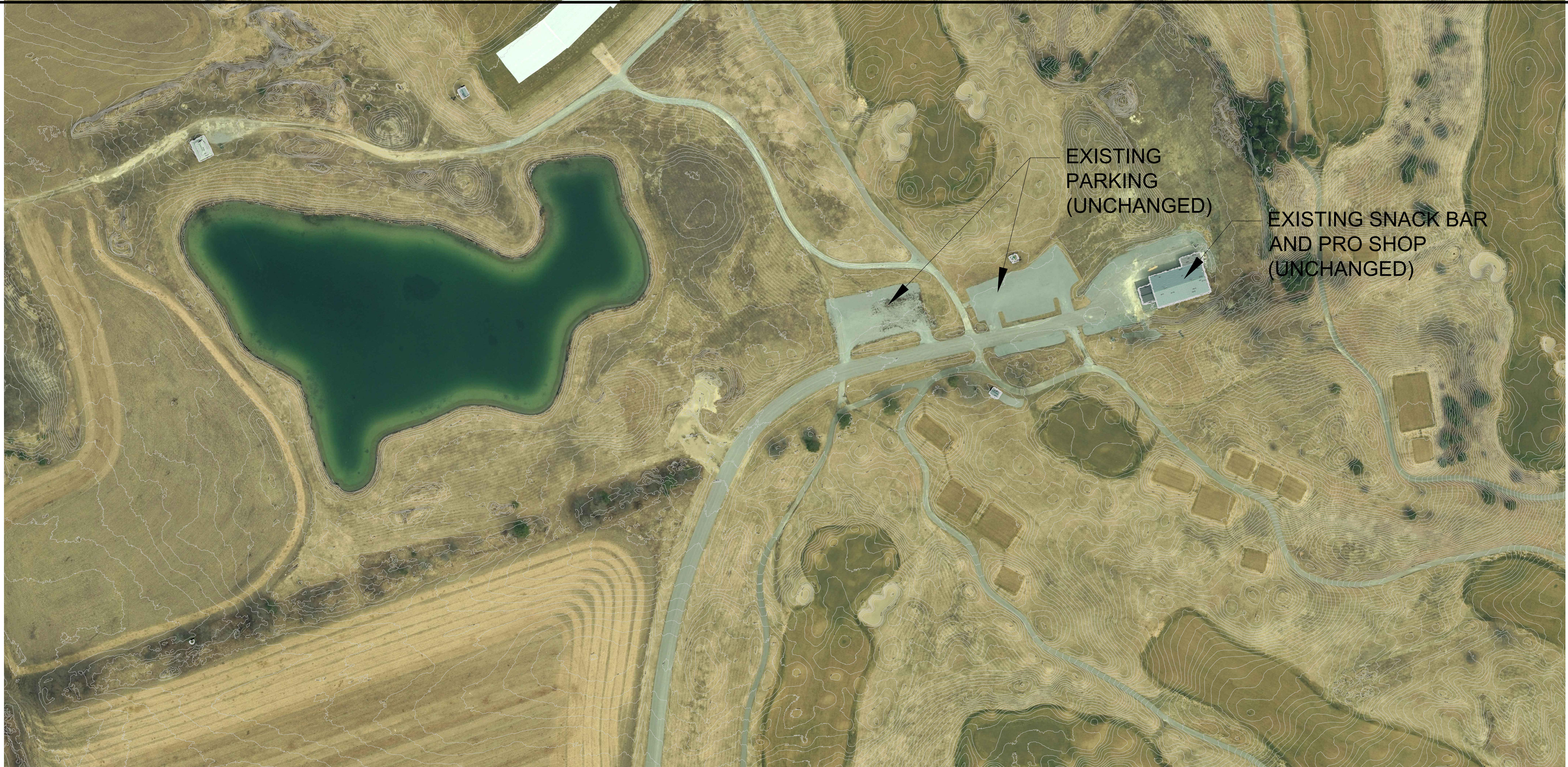
2 TOPOGRAPHICAL OF EXISTING SITE AND STRUCTURES A1.1 1:1000