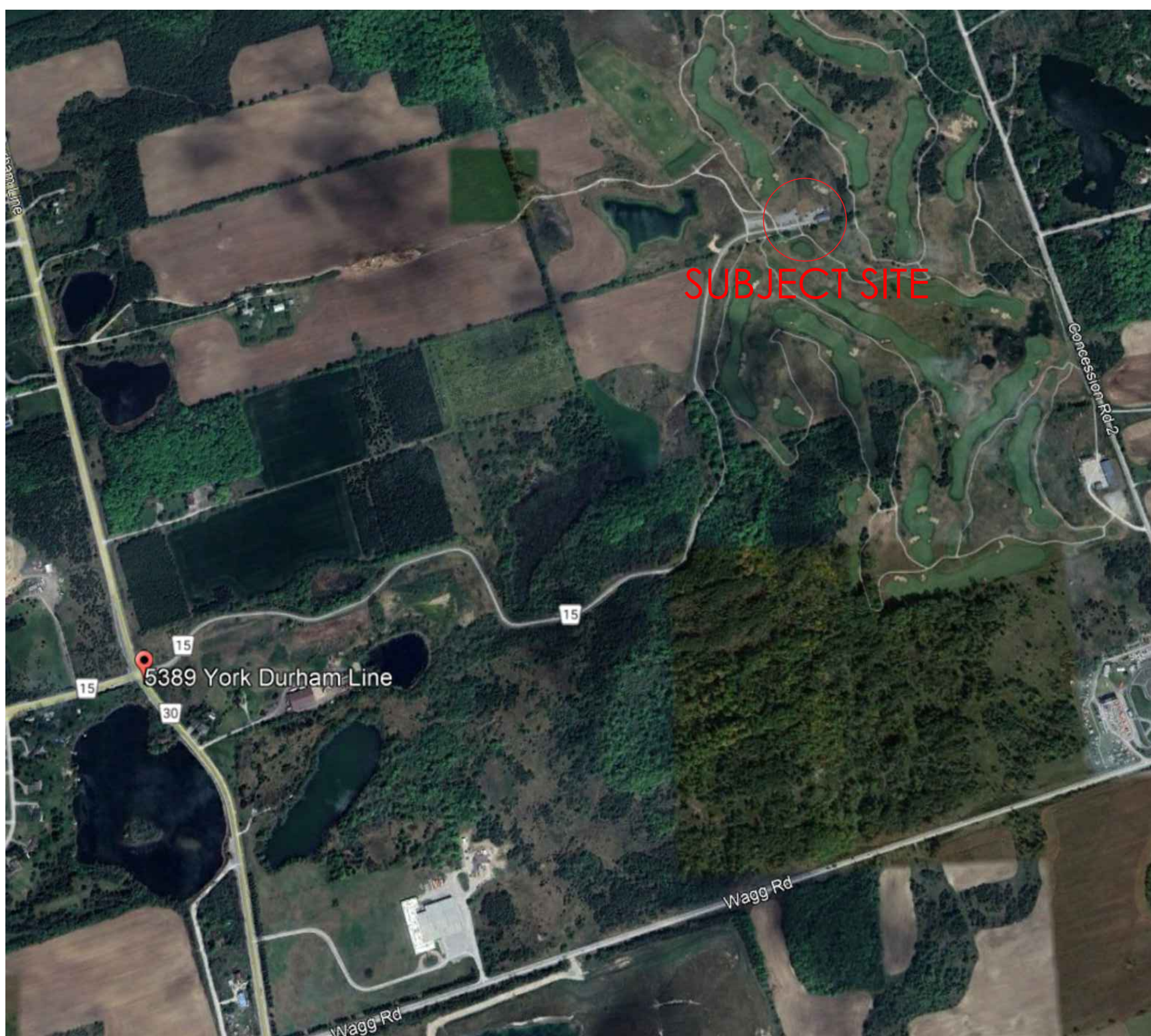
1 KEY PLAN A1.1 NTS