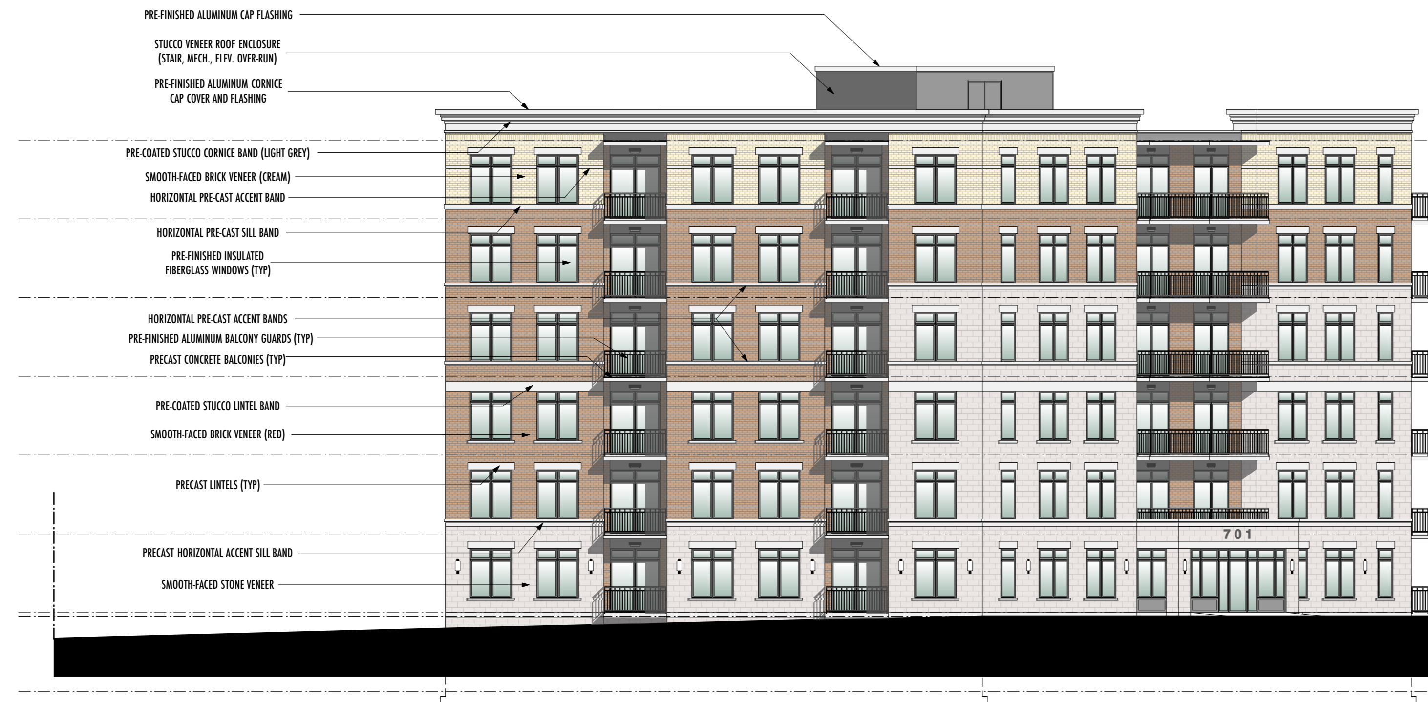
SOUTH ELEVATION (BROCK STREET WEST)