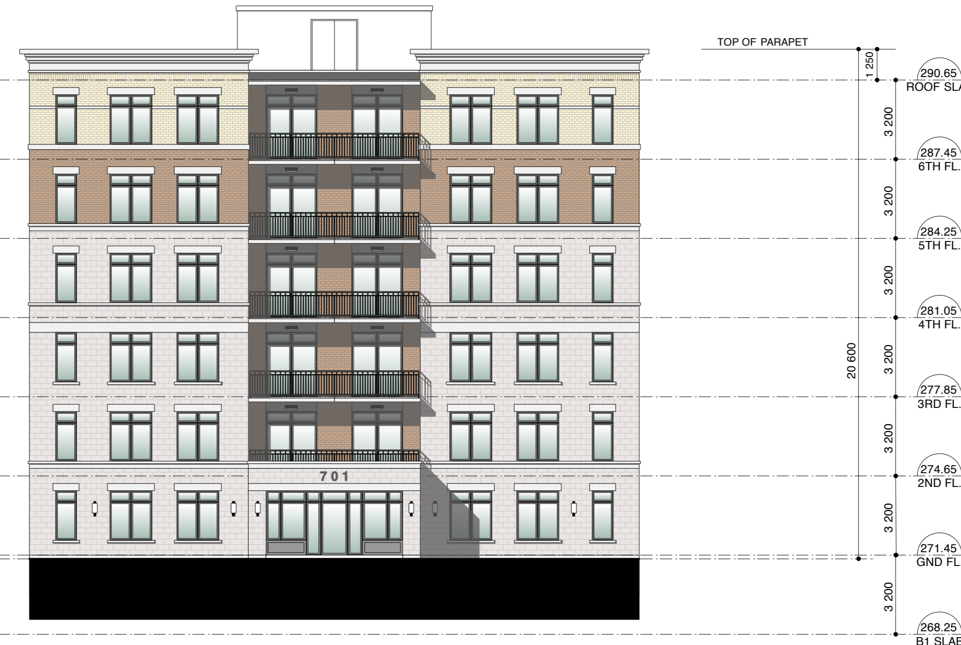
SOUTH-EAST ELEVATION (DAYLIGHT TRIANGLE)