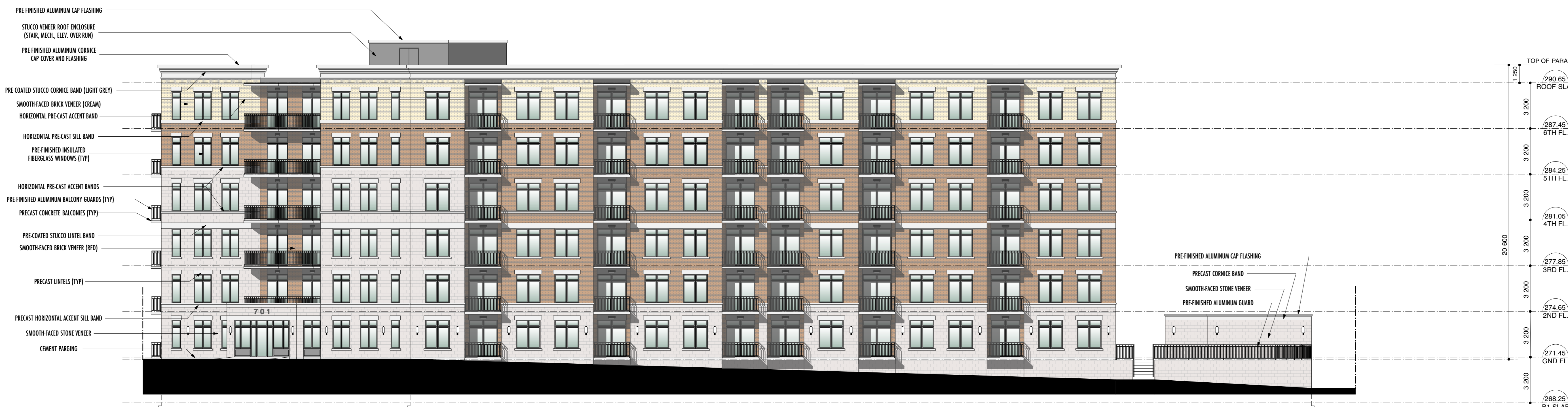
EAST ELEVATION (HERREMA BOULEVARD)